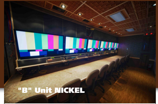
"B" Unit NICKEL